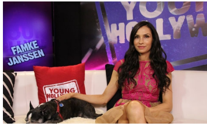
Famke Janssen on "Hemlock Grove" & Her Biggest Skincare Tip