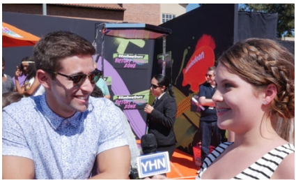
Kids Choice Sports Awards: Jake Miller, Mario, Madison Beer, & More on Fave Athletes