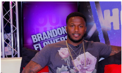
NFL Star Brandon Flowers on the Importance of the Cornerback