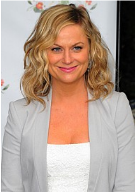
Another 'Wet Hot American Summer' Coming to Netflix?