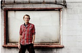
PLAYLIST PICKS: New Mongrels